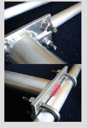
Heavy-duty dipole fixture