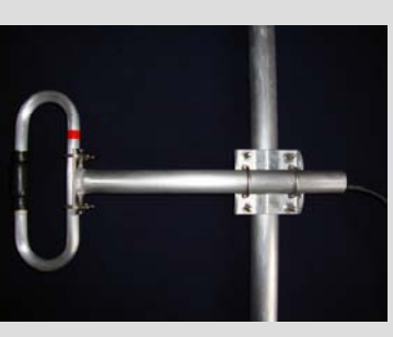
½ - wave spacing (1.45 – 1.80 dBd gain) (Bi-directional / Elliptical pattern)